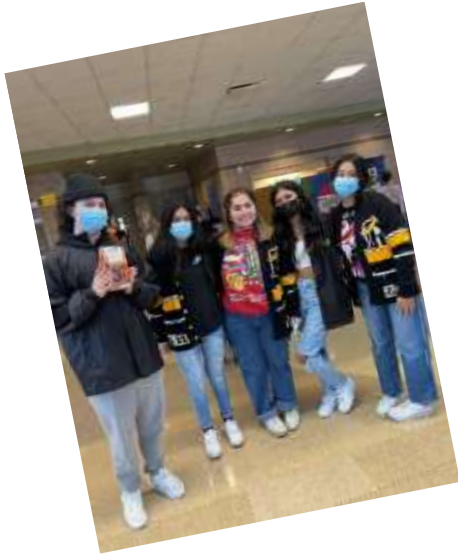
LIA students volunteered at the Community Christmas event.